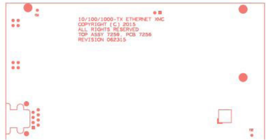
COMPONENT PLACEMENT VIEW - SIDE #2